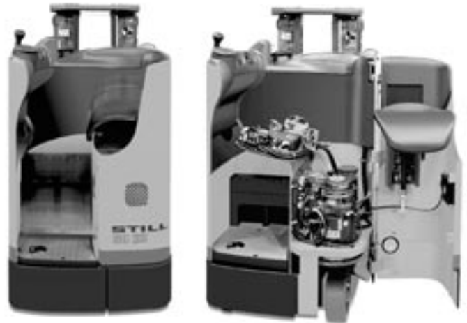
Best service accessibility thanks to wide opening driver's door.