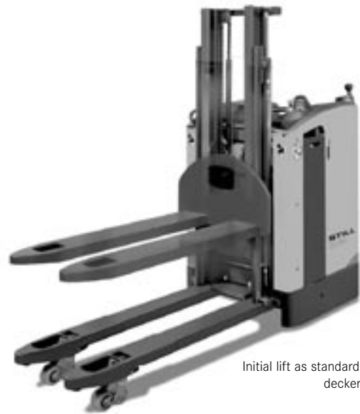
Initial lift as standard for double decker transport.